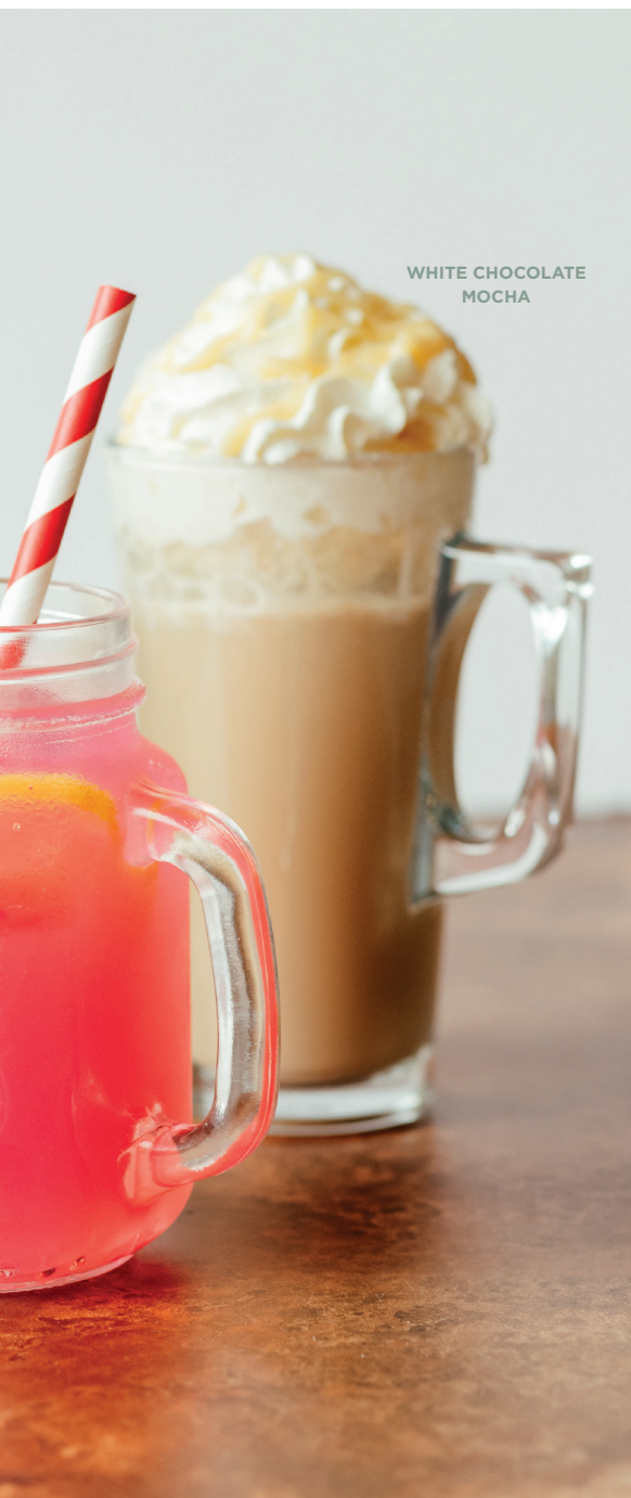
WHITE CHOCOLATE MOCHA