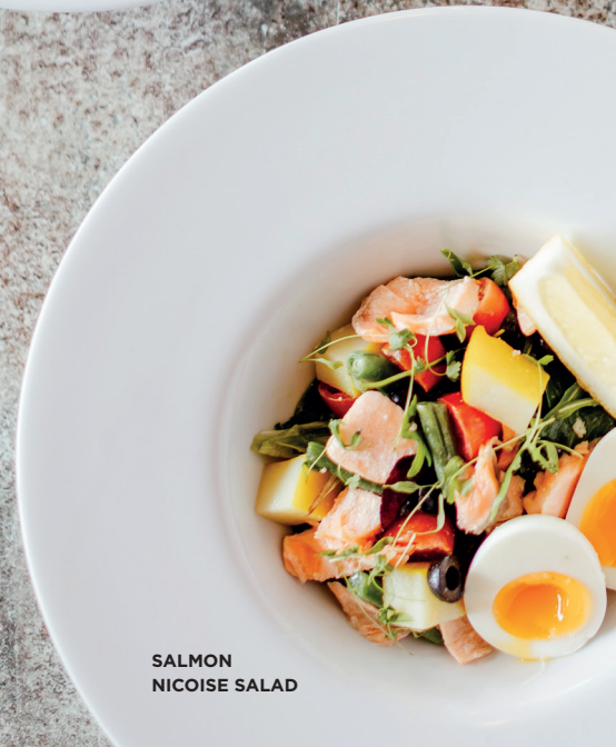
SALMON NICOISE SALAD