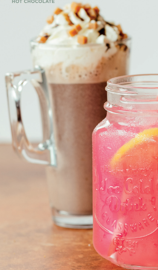
DRAGON FRUIT & MANGO COOLER