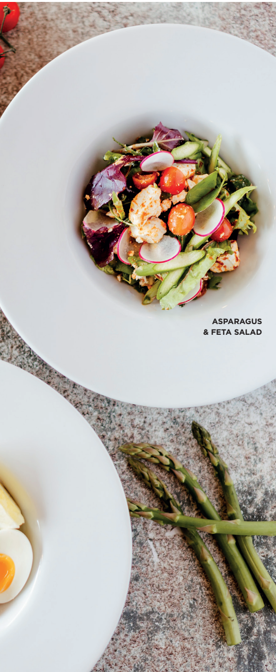
ASPARAGUS & FETA SALAD