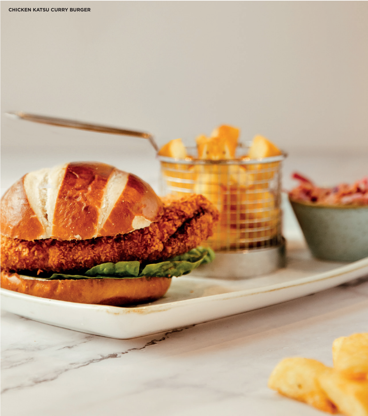
CHICKEN KATSU CURRY BURGER

Served with Frosts Homemade Yorkshire Pudding, Thyme Roasted Potatoes, Steamed Green Vegetables, Carrots, Cauliflower Cheese & Gravy