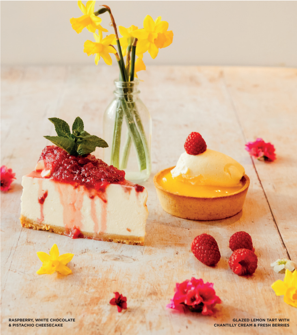
RASPBERRY, WHITE CHOCOLATE & PISTACHIO CHEESECAKE