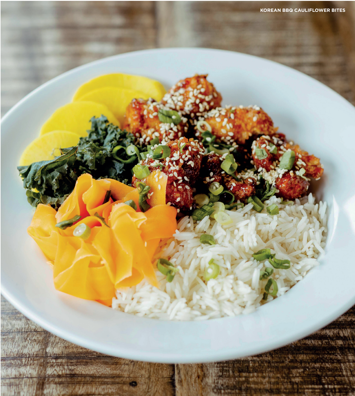
KOREAN BBQ CAULIFLOWER BITES