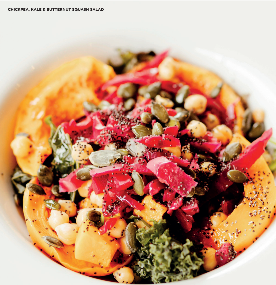
CHICKPEA, KALE & BUTTERNUT SQUASH SALAD

Gluten free options are available, please ask your server.